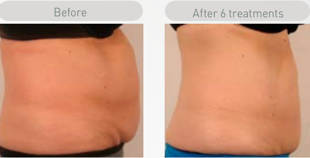
Pollogen in-house collection